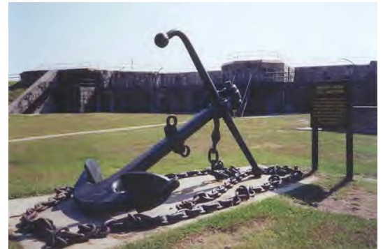
Anchor from the U.S.S. Hartford

FOLLOWING the tour of Fort Gaines, we went to the interactive Mobile Bay Estuary & Aquarium also located on Dauphin Island. There our troop saw all sorts of plant life and animal life, including sea creatures: jelly fish, turtles, sea snakes, sea frogs, and the amazing electric catfish.