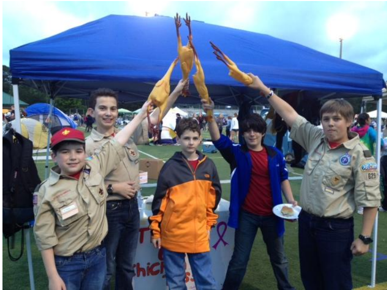
Relay for Life night