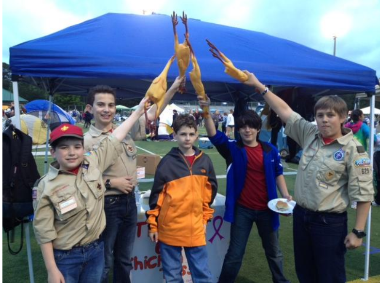
Relay for Life night