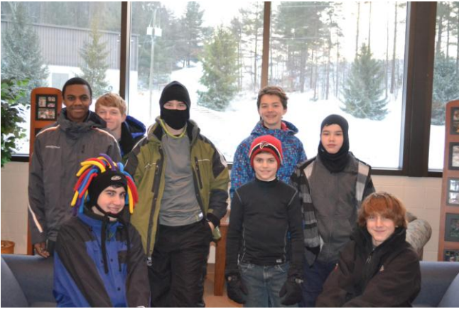
Winter Place Ski Trip