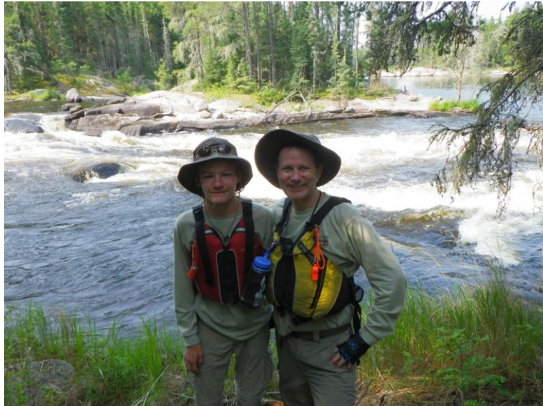
Being a trained leader pays off in many ways- Northern Tier