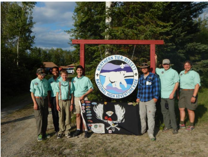
T629 Northern Tier Crew 2014

All Newsletters, pictures and up to date information are at www.troop629.org