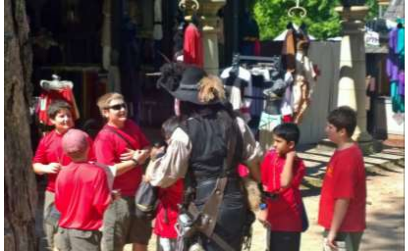
Above, it looks like a villain has captured the Scouts' attention...or perhaps he has captured a Scout at the Renaissance Festival!