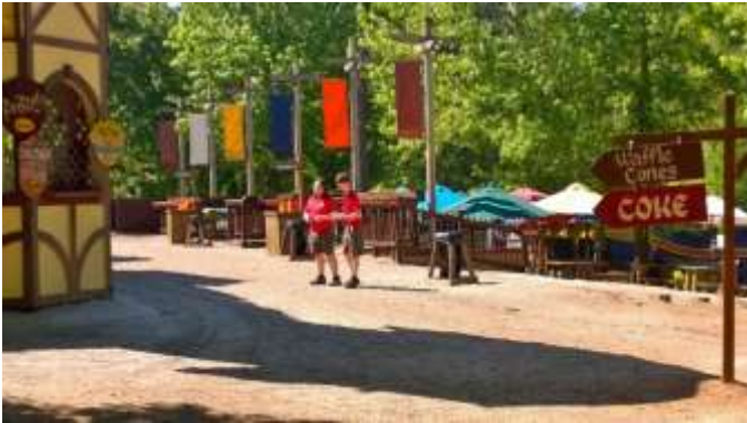
Even Waffle Cones and Coke take on Old World flair at the Renaissance Festival!

Stay tuned for pictures from the Bahamas Sea Base High Adventure Trip!