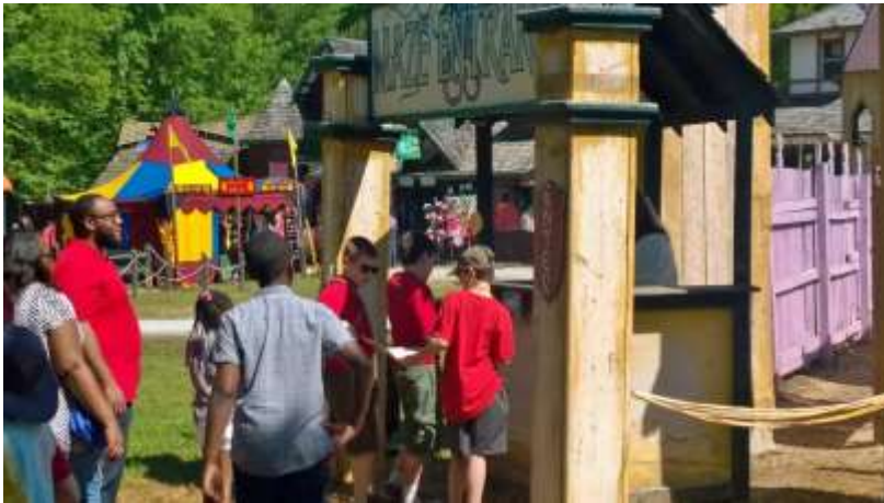
Above, Scouts in line for an aMAZEing time!