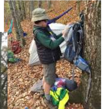
Hanging packs in the trees