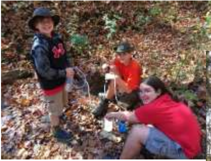
Pumping and filtering water

This newsletter is intended for Troop 629 Scouts and their families.